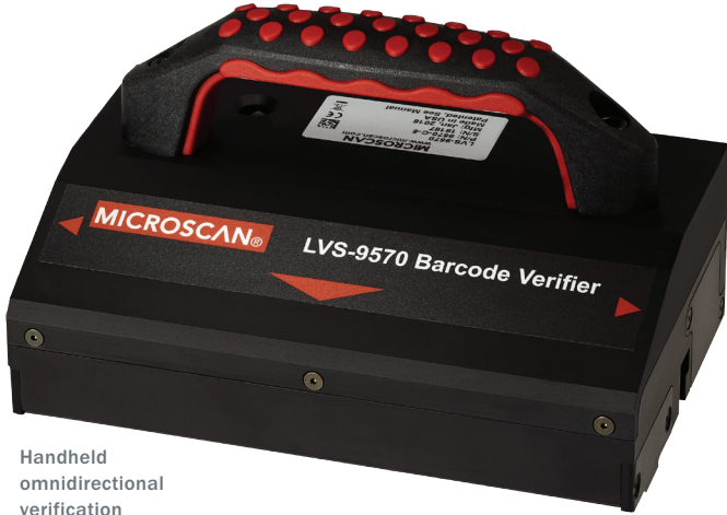
Handheld omnidirectional verification