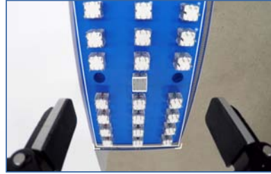
IMAGE-ENHANCING LIGHT GUARANTEES OUTSTANDING OBJECT RECOGNITION

The OMRON TM Collaborative Robot features a built-in vision system. The integrated camera localizes objects in a wide field of vision, and the image-enhancement light enables object recognition under almost any conditions. The vision system improves reliability, consistency, and high-precision placement, and includes functions such as pattern matching, barcode reading, and color classification which enable inspection, measurements and sorting with no additional cost or effort.